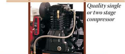
Quality single or two stage compressor