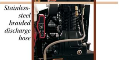
Stainless-steel braided discharge hose