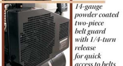
14-gauge powder coated two-piece belt guard with 1/4-turn release for quick access to belts