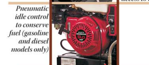
Pneumatic idle control to conserve fuel (gasoline and diesel models only)