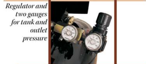
Regulator and two gauges for tank and outlet pressure