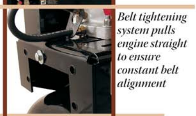
Belt tightening system pulls engine straight to ensure constant belt alignment