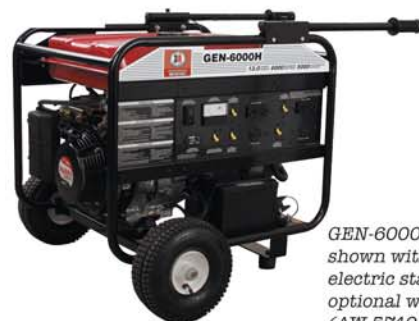
GEN-6000-OMSE shown with electric start and optional wheel kit (AW-5740-0004)