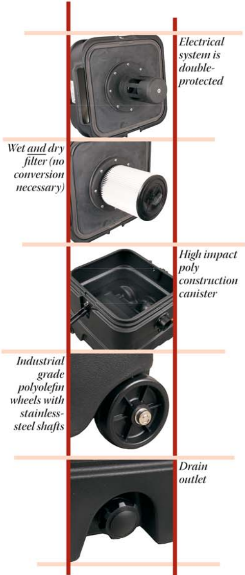
Electrical system is double-protected